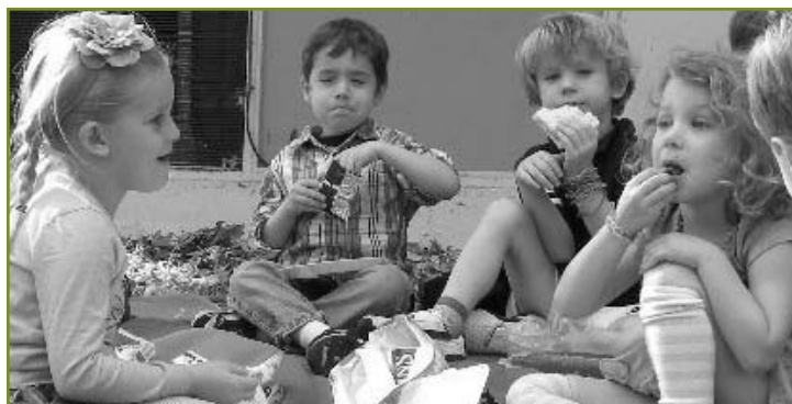
DECC students enjoy lunch in their new outdoor classroom.