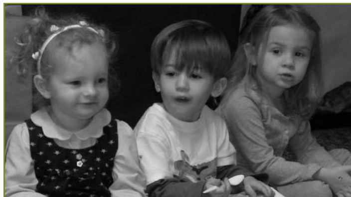
DECC students celebrate Thanksgiving with feasts.

educating our young children and providing for their individual needs. Their energy is astounding and they are truly what make this school the wonderful preschool that it is. In the coming months, I will tell you more about our staff.