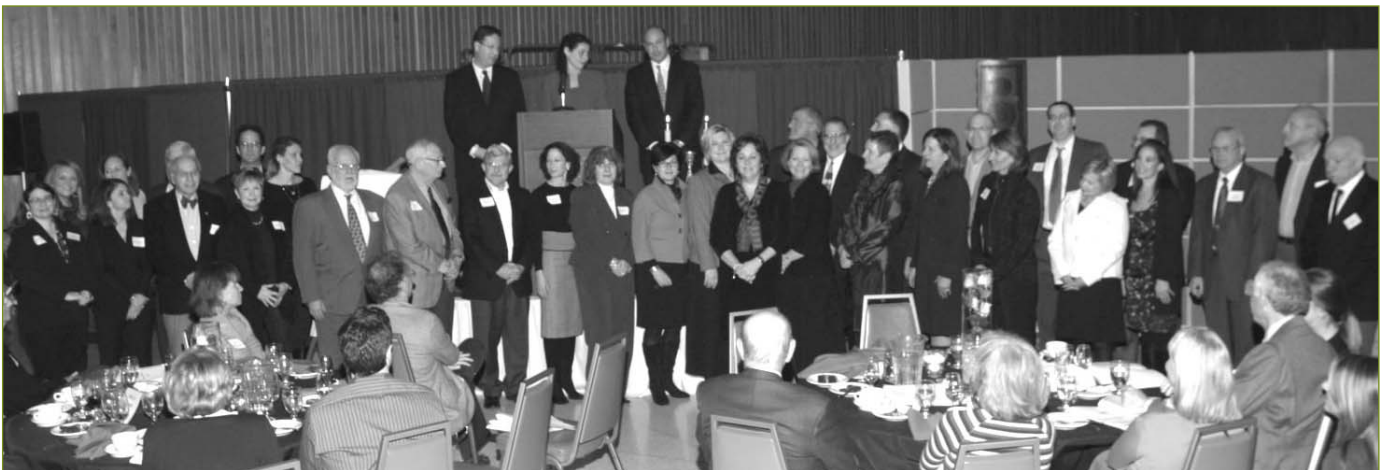
2011 Board of Trustees.